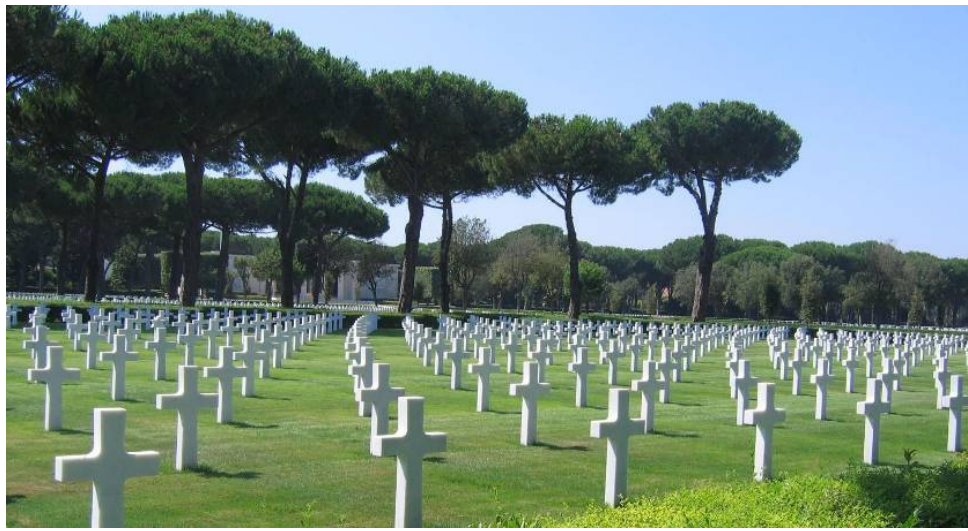
The U.S. Military cemetery at Anzio-Nettuno Italy, final resting place of eighteen Red Dragons.

As you can see, some of the names above reached us late. If you know of the death of a Red Dragon please let us know.