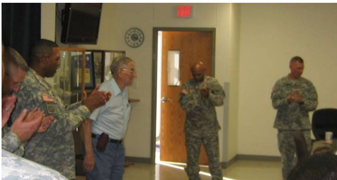
Leon relates an event from the fall of 1944 when the Red Dragons were with the First Airborne Task Force defending Seventh Army's flank in the Maritime Alps.