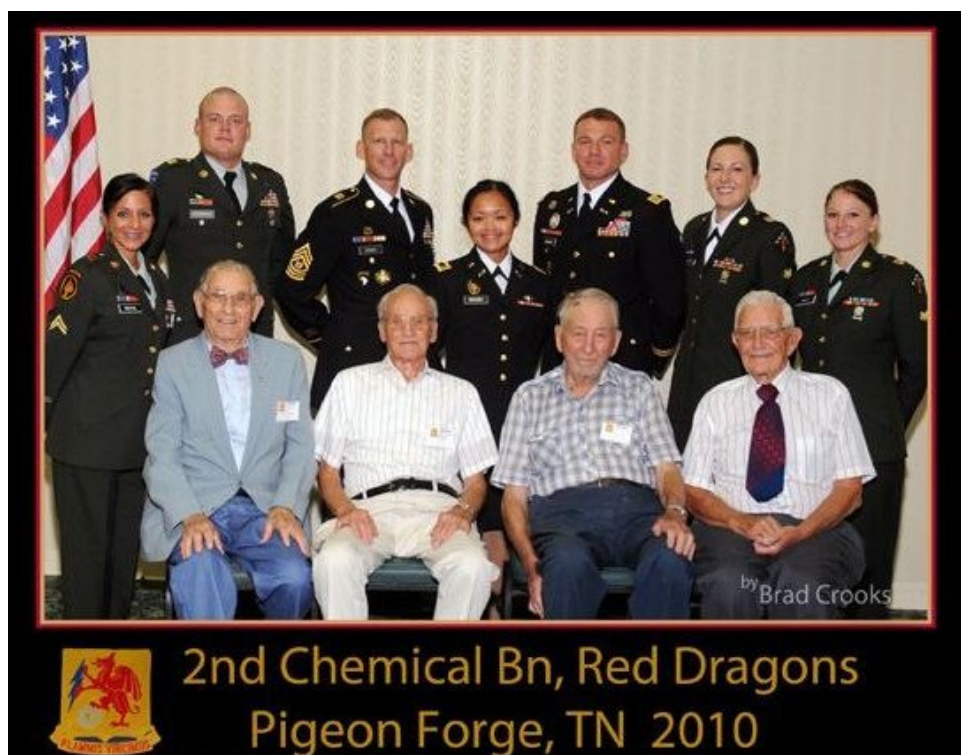
Pigeon Forge TN Reunion: World War II Veterans with active duty personnel from Fort Hood