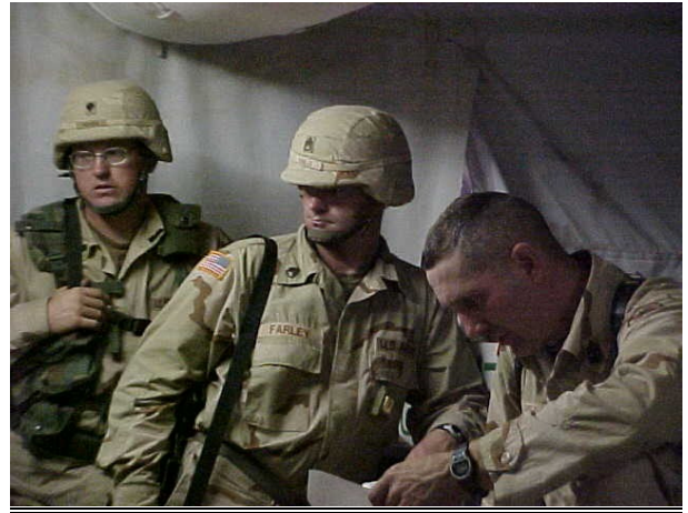
Red Dragons of 46 th Cml Co in Tikrit, Iraq

often need children to bring them, and that is a problem if the grandchildren are in school